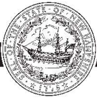
TABLE OF CONTENTS Disease Handbook for Child Care Providers